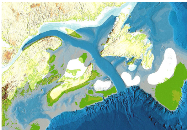
Ice coverage and exposed land areas, 15,000 calendar years ago.