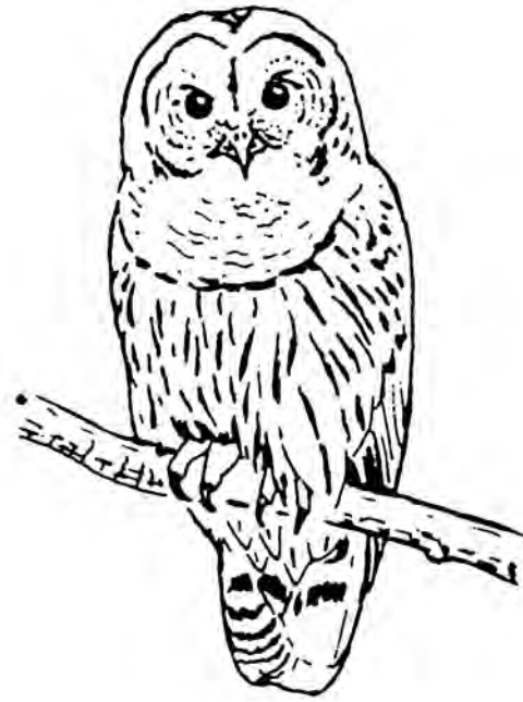
ku'ku'kwes (Barred owl)

Ms. Burnsbee rolled her eyes at the children and turned her back to write on the whiteboard. She was eager to get back to routine as half of the morning has been wasted on "foolishness." After all, it was her job to be strict, stern, and to get the job done! She felt sorry for the boy and really did want to make him feel welcome. Sqqqqqueeak! Her black leather shoes made a sound as she